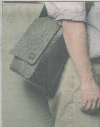
These field bags by Jack Spade are examples of what men are carrying.

several different ones — a Coach bag, a Bruno Magli — and has for more than 20 years. And none of this "man bag" business for him. His Honor just calls them purses.