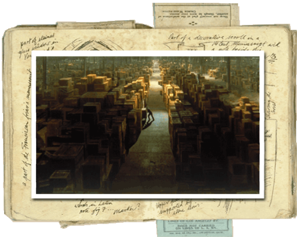
Warehouse Scene from Raiders of the Lost Ark

Permit me first to speak about the overall mission and role of the Archives. The Archives is the conscience of State government and the protector of the collective memory of our triumphs and failures as a society. On a fundamental level, the Maryland State Archives must be the repository for security copies of the records which constitute the collective memory of our world in whatever format they exist, taking care of course, not to save too much and overwhelm our capacity to evaluate and absorb the accumulated wisdom. Our role is not only to save well, but also to manage what we do save effectively. There is a final scene in Raiders of the Lost Ark (see below), which we aspire to not allowing to happen in real life. What is stored must be known and retrievable, not simply lost in a cavernous warehouse somewhere.