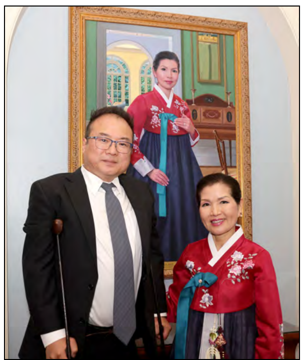
The portraits were privately funded by The Foundation for the Preservation of Government House of Maryland, Inc.