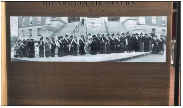
A large photo mural has been installed adjacent to the State House Inn on State Circle. The photo is from the Archives collection of suffragettes on the steps of the State House in 1914. Archives staff contributed to the collaboration with Senator Sarah Elfreth and the City of Annapolis to produce this mural and the accompanying interpretive plaque.