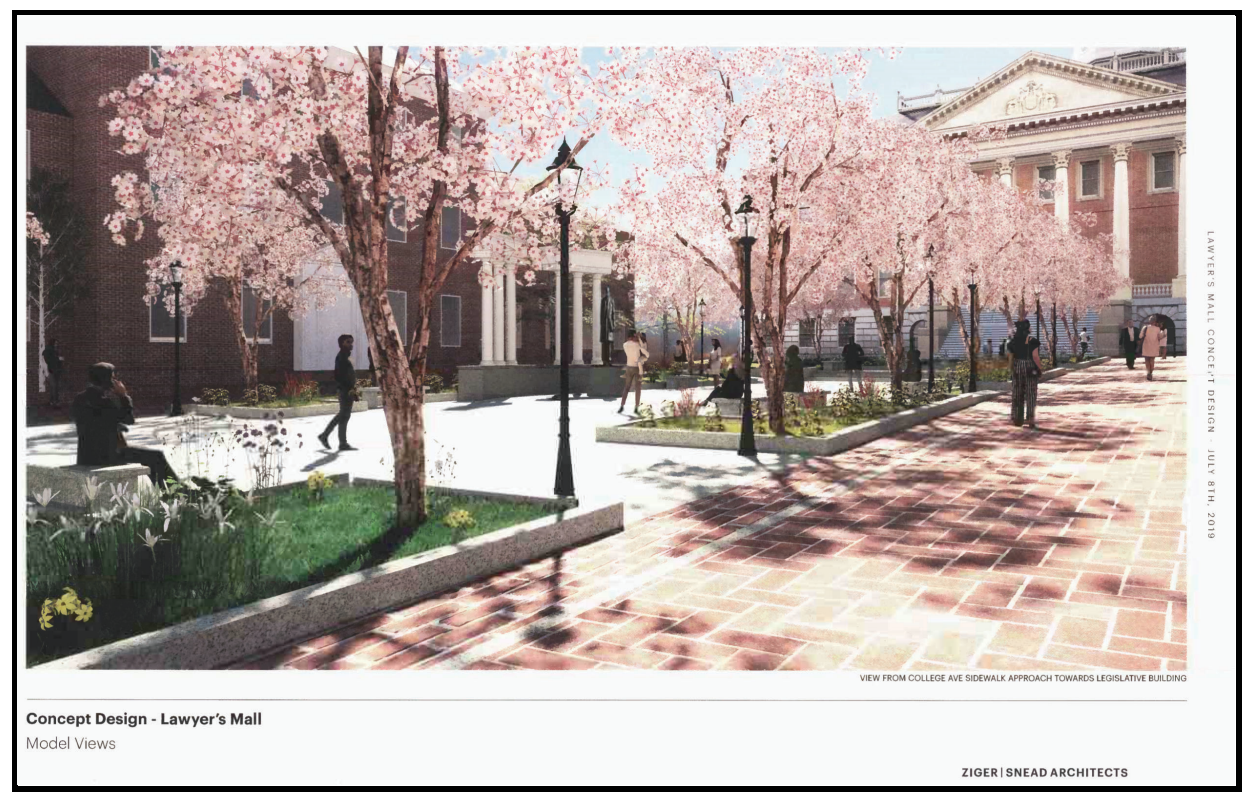
Rendering of adopted plan for redesign of Lawyers' Mall and reinstallation of the Thurgood Marshall Memorial, June 2019

Lawyers Mall. The Thurgood Marshall figure, which was temporarily relocated to the Courts of Appeals, and the other bronzes were moved to Rolling Run.