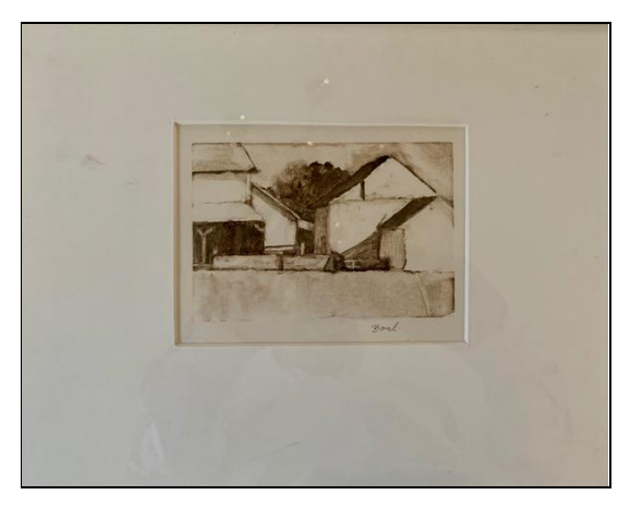
Barns, monotype, by Jack Boul, gift of the artist